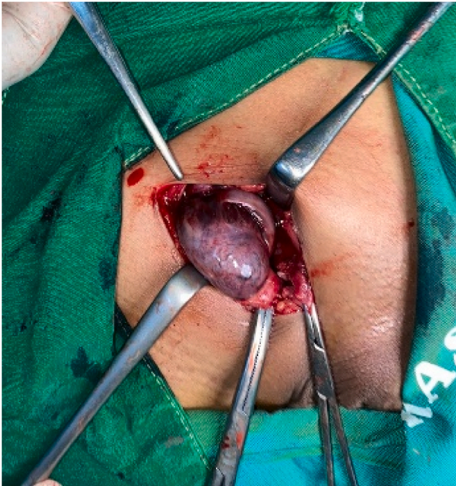
Fig. 2. A perioperative image shows the black-colored testicular torsion found in the inguinal canal.

erythema, a hard or soft mass in the inguinal area, and an empty ipsilateral hemiscrotum. 4